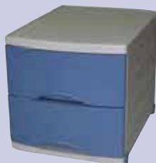
DESK DRAWERS item no. 6115