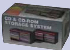
CD & CD-ROM STORAGE SYSTEM item no. 4835