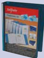
FLAT BINDER 50MM - item no. 3295