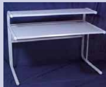
COMPUTER DESK item no. 5134