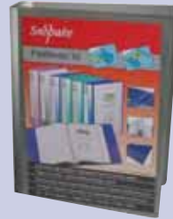
FLAT BINDER 35MM item no. 3293

Spend € 150 (Ex.Vat) worth of office supplies and receive