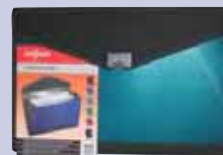
13 PART ORGANISER item no. 3300

Spend € 600 (Ex.Vat) worth of office supplies and receive