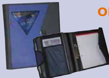
3 IN 1 ORGANISER - item no. 6089